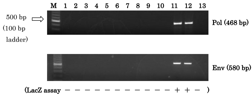
Figure 2 Polymerase chain reaction (PCR) analysis of RD114 virus in buffy coats. Genomic DNA extracted from the buffy coat samples of dogs (n = 3 for each group) in three groups (A: RD114 virus inoculated group; B: inactivated virus group; C: control group) was tested for the presence of RD114 virus. Lanes 1-3, group A; 4-6, group B; 7-9, group C; 10, negative control (medium); 11, positive control 1 (RD114 stock virus); 12, positive control 2 (buffy coat of group C mixed with RD114 stock virus); 13, negative control (distilled water). No PCR positives were obtained from any of the experimental groups A-C.