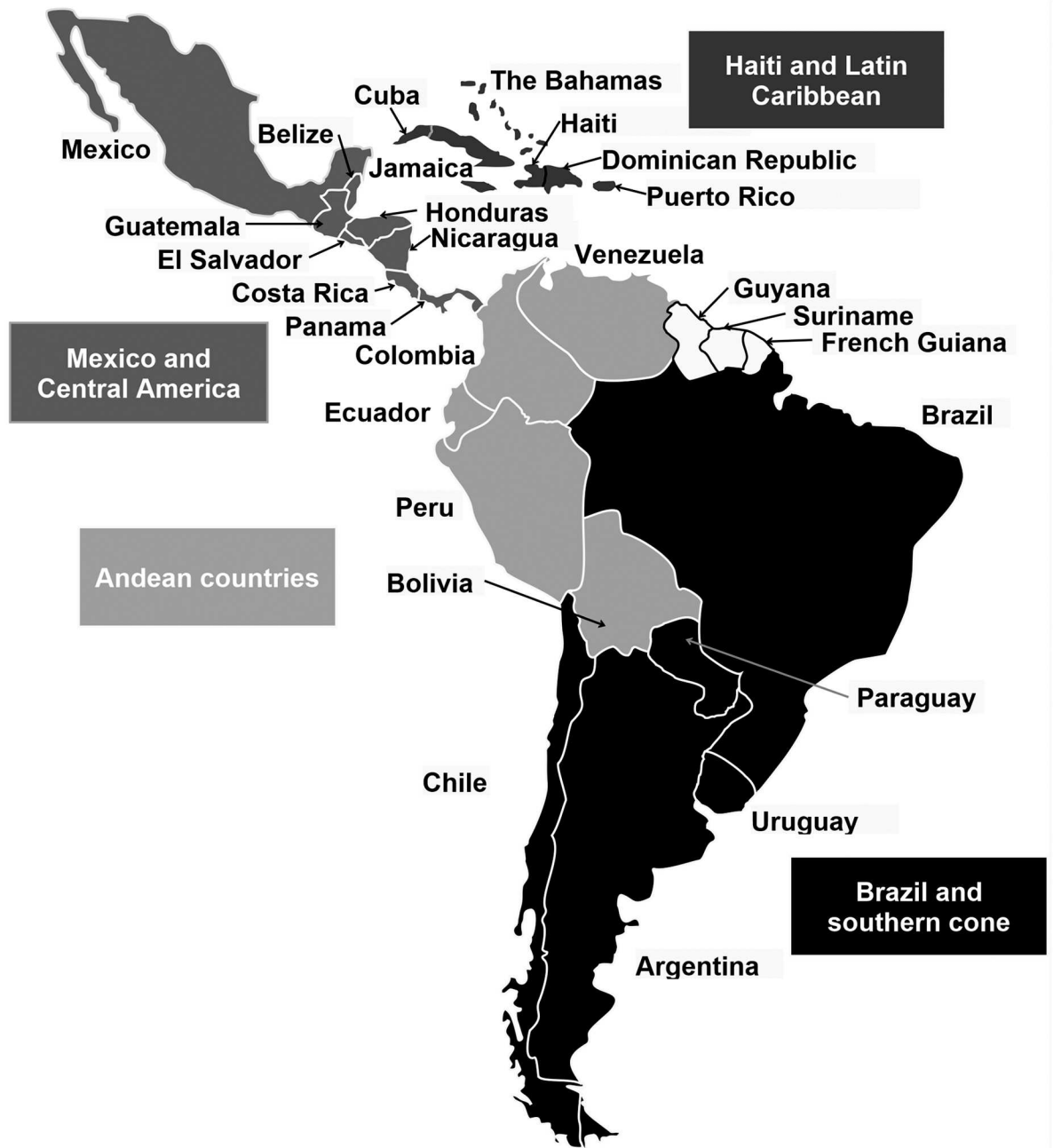
Fig 1. The Latin American region. The strict definition of ‘Latin America’ is the region of the Americas where Latin languages are spoken (Spanish, Portuguese and French). These countries have more in common with each other, sharing elements of historical experience, language and culture, than they do with North America. Nevertheless, Latin America is a diverse group of countries, with varied landscapes, peoples and cultures. However, for the purposes of this review, we included all countries within the Caribbean and Central and South America, and did not exclude countries located in the same region that speak other European languages, such as Belize, Guyana and the smaller Caribbean island nations. Colour code: Black: Brazil and Southern Cone; Dark Grey: Haiti and Latin Caribbean; Mid Grey: Mexico and Central America; Light Grey: Andean countries.