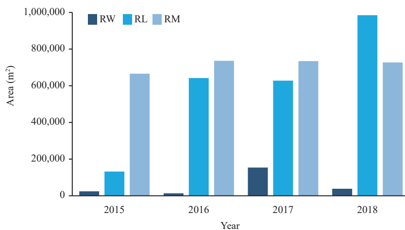
FIGURE 2. Re-emergent habitats change of O. hupensis by different epidemic types in national schistosomiasis surveillance sites in China from 2015 to 2018.

Abbreviation: RL: Re-emergent habitats of O. hupensis in lake and marsh regions; RW: Re-emergent habitats of O. hupensis in water-network regions; RM: Re-emergent habitats of O. hupensis in mountainous regions.