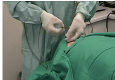
Fig. 1 Simulated jugular central venous catheterization assessment in an Adult IV simulated model, using a tracking motion device on their hands: the ICSAD

Residents keep an active registration of the number of procedures they complete during the 3 year residency. Prior jugular CVC experience of the different groups is shown in Table 1.