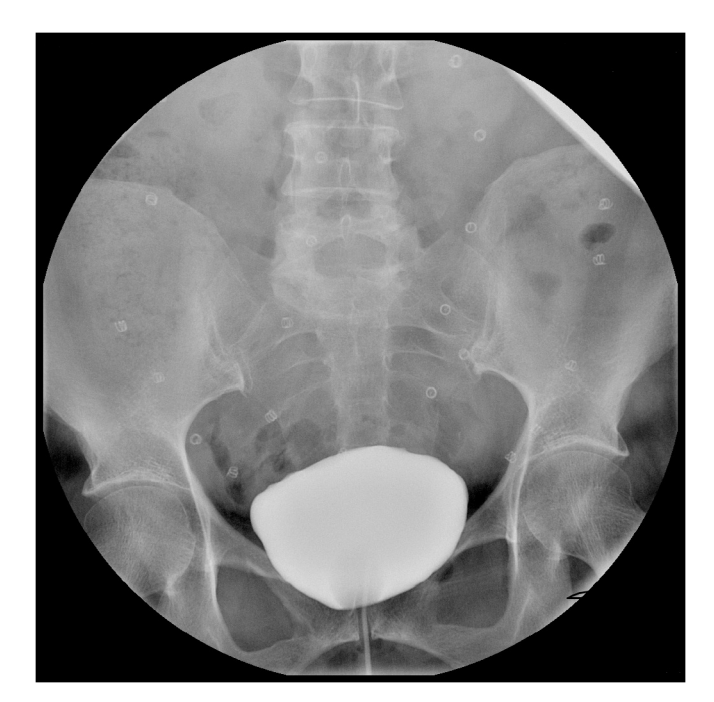
Fig. 3. Normal postoperative cystography.

on bladder wall during cystoscopy, we could not see any part of the mesh inside the bladder but during open surgery we found that mesh migrated and adhered to the bladder wall just near the fistulous opening. Our patient had occasional complaints of suprapubic pain, dysuria and difficulty in voiding especially in the mornings started a year after hernia repair. Each time, she was told she had cystitis and her complaints improved within a few days after treatment. It is hard to comment on whether these symptoms were due to irritation of bladder by mesh or they were just unrelated complaints.