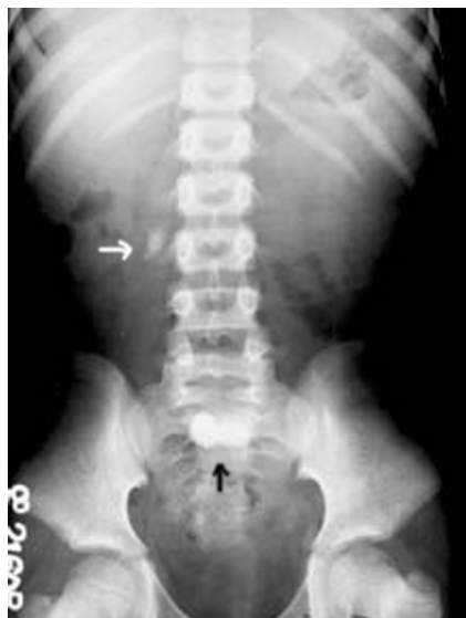
Figure 1. Plain x-ray KUB showing a single stone on the right side (white arrow) at the level of the third lumbar vertebra and 2 stones overlying the sacrum (black arrow).