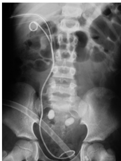
Figure 2. X-ray KUB showing 2 calculi overlying the sacrum in the left ectopic pelvic kidney. Nephrostomy tube and double “J” in situ seen on the right side.

was confirmed, and the laparoscopic ports were removed. Complete clearance was documented with plain x-ray KUB.