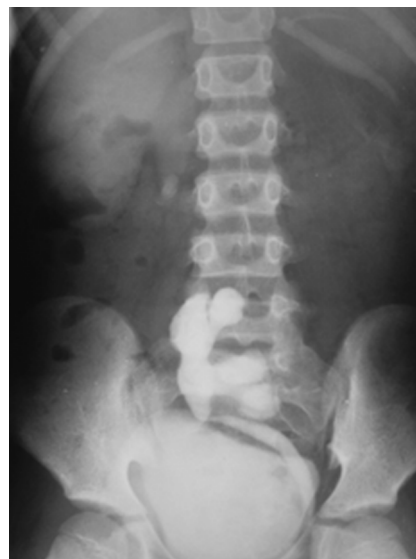
Figure 3. Intravenous urography showing an ectopic left pelvic kidney with the stone lying in the pelvis and the calyx.