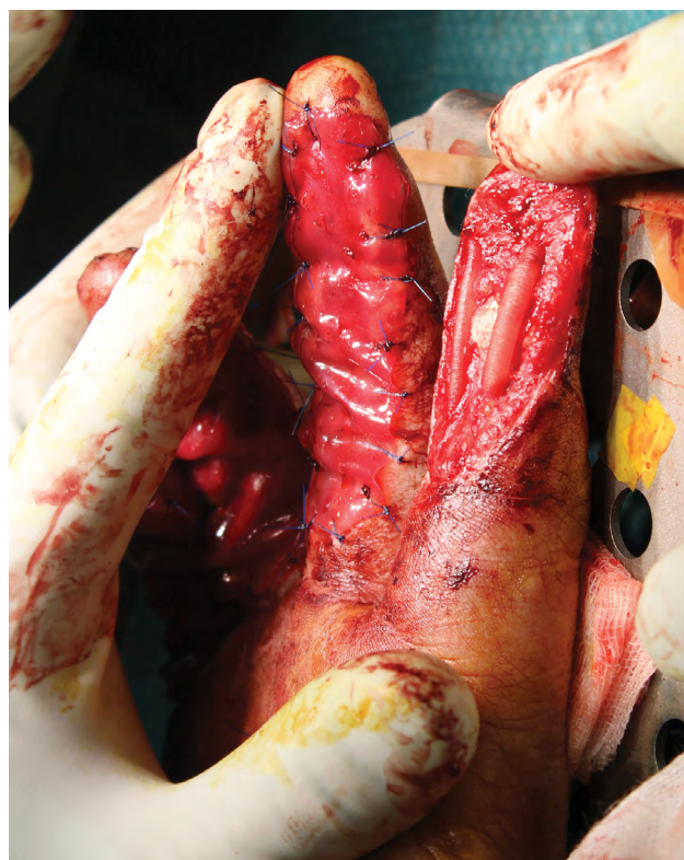
Fig. 2. Application of neurotubes in patient 1.

functional thumb–index grasp with the ability to perform fine gestures (close buttons on his shirt, move small objects). He felt pressure on the palmar surface of the fingers with his eyes closed. DASH score was 14.