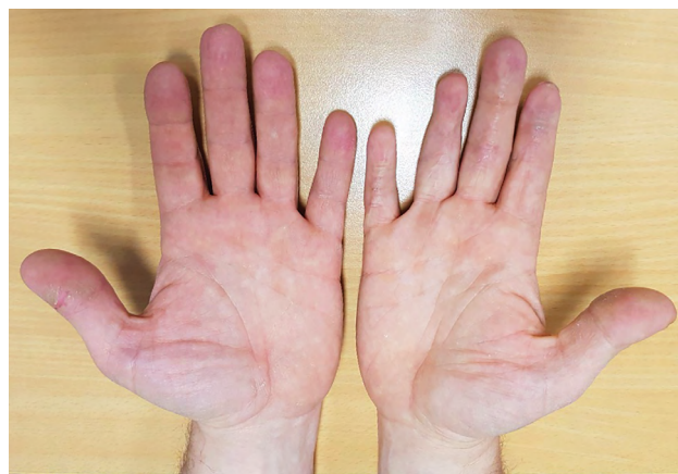
Fig. 4. Cosmetic appearance at 1 year in patient 1.

Ellis and Kulber 3 reported a very high satisfaction in their series with no complications. There were no major postoperative complications, except for late osteomyelitis of the third phalanx amputated in the second patient, with a good response to antibiotic therapy. We also acknowledge that in this same case, the use of DM instead of a groin flap was debated and long discussed with the patient. After a positive Laser Doppler for sufficient vascularization in the distal phalanges and the patient's preference for a shorter and less laborious reconstruction, we finally opted for MatriDerm use.