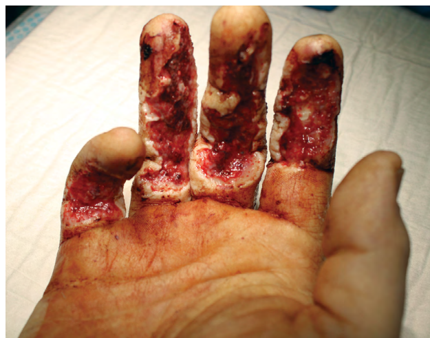
Fig. 1. Palmar defect of the right hand in patient 1 before surgical debridement.

At 8 months posttrauma, examination showed 0-20-60° mobility for MCP of D2, D4, and D5, 0-30-60° for MCP of D3 and 0-35-60° for the proximal interphalangeal (PIP) of D4. The skin appearance was good, and the patient had a