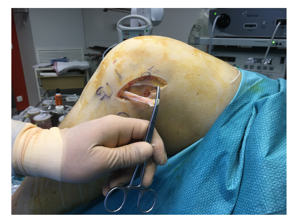
Fig. (2). Harvesting of the iliotibial band strip is shown.

tensioned at the medial side at a 60^{\circ} to 90^{\circ} angle of knee flexion, and a 10^{\circ} to 15^{\circ} angle of external rotation of the foot in accordance with studies that have shown higher tensioning of this structure with increased knee flexion [12,13]. The ITB-strip is then fixed in the femoral tunnel with a metal interference screw with a diameter of 6 mm (Fig. 5 ). The ITB window, subcutaneous tissues, and skin are closed.