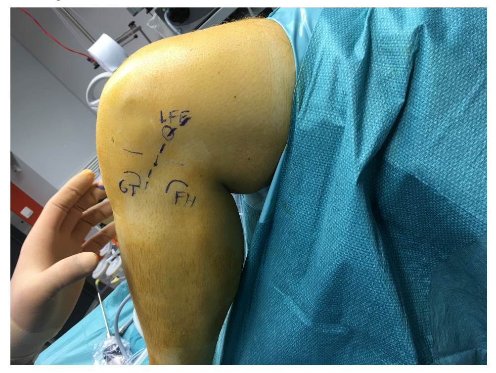
Fig. (1). Anatomic landmarks for the anterolateral ligament are indicated. Abbreviations: LFE, lateral femoral epicondyle; GT, Gerdy tubercle; FH, fibular head.

Ethics committee approval was obtained. The patient was informed that photographs from the surgical procedure would be submitted for publication, and his consent was received.