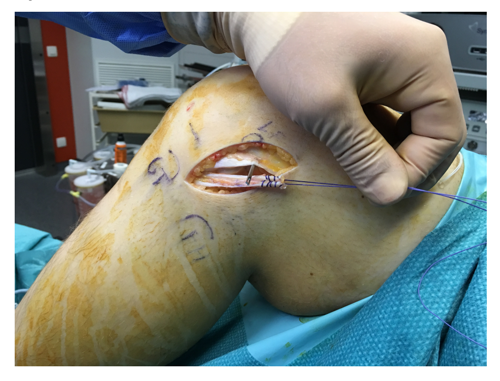
Fig. (4). The proximal end of the iliotibial band strip is prepared.