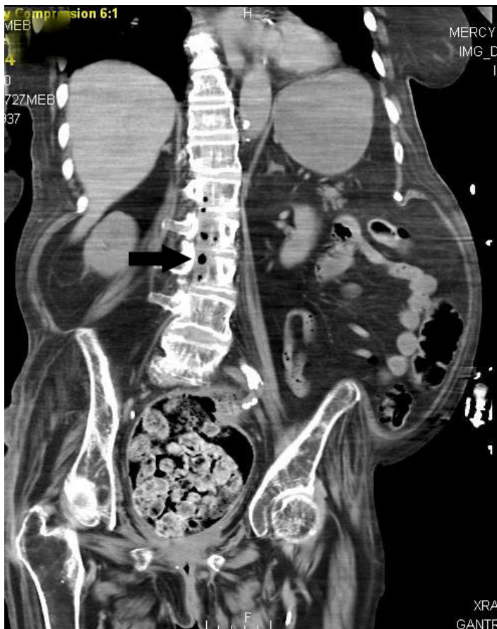
Figure 1. Computed tomography reconstructed coronal image of the abdomen and pelvis demonstrating gas in the thoracolumbar spinal canal (arrow).

Pneumorrhachis, a rare radiographic finding, is defined as