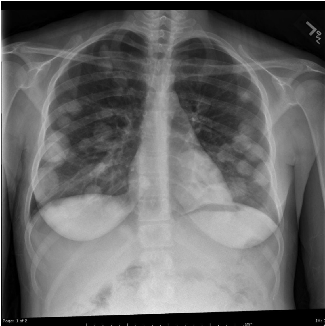
Figure 1: X-ray showing over forty rounded opacities measuring 2–4 cm scattered throughout the lungs that appeared consistent with metastatic disease.