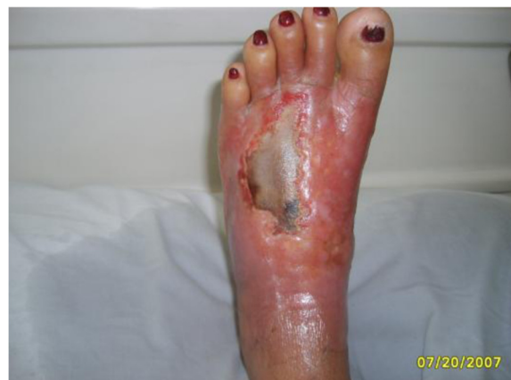
Figure 1 Hyperaemic and ulcerated lesion in the left lower limb.

The highest rates of IE are observed among patients with prosthetic valves and catheters. Other risk factors include chronic rheumatic heart disease, age-related degenerative valvular lesions, HD, and coexisting conditions such as diabetes, human immunodeficiency virus infection, and intravenous drug use. The clustering of several of these