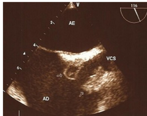
Figure 4 Echocardiography showing two images of sub-endothelial abscesses in the transition from the superior vena cava and right atrium.

of blood (with first and last sample drawn at least 1 h apart).