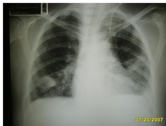
Figure 2 Image of chest radiography with areas of opacity and an image of double-lumen CVC for HD implanted in the left jugular vein.