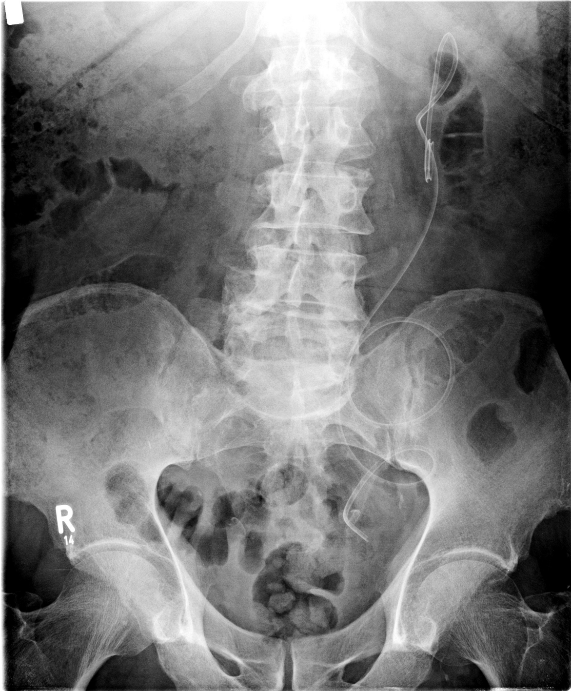
Figure 4 Radiograph after laparoscopic operation.

cytology to exclude infection and tumor. The appearance of the lymphocele fluid varies from tan to dark yellow or brown, depending on the amount of fat.