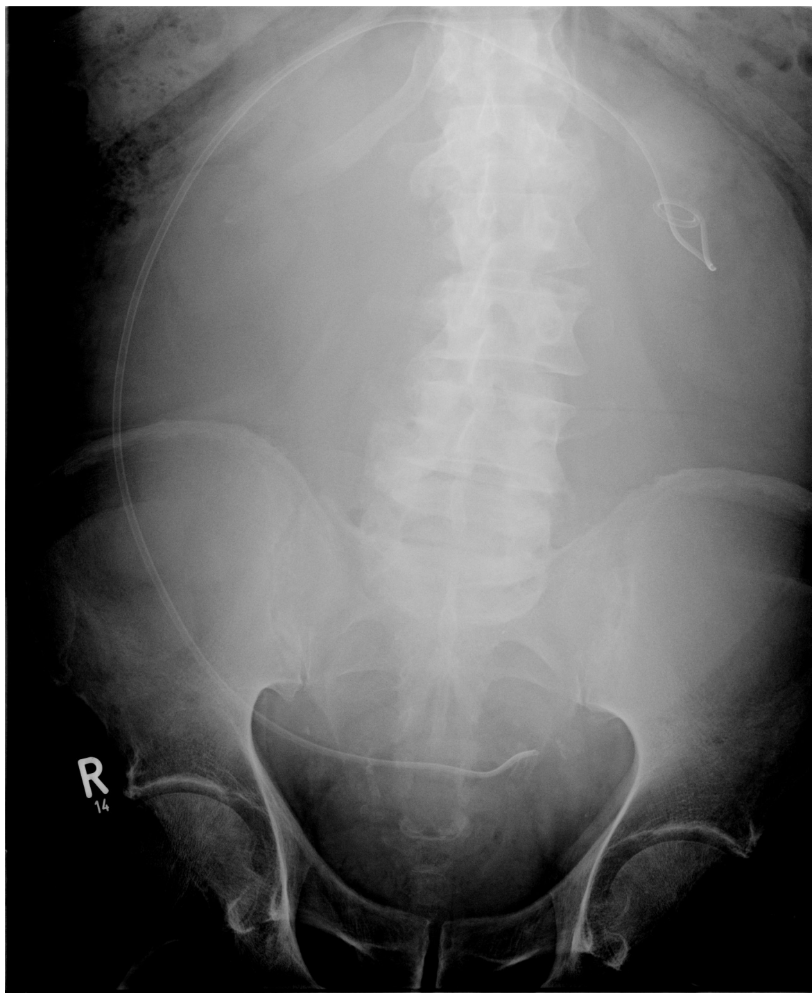
Figure 1 Radiograph after ureter stent insertion.

Microscopic evaluation of the fluid revealed mostly lymphocytes and red blood cells; in the resected wall of the lymph cyst, collagen and muscle fiber were found, with no malignancy. Laboratory study was consisted with lymphatic fluid as well; the result was sterile lymphatic fluid. After