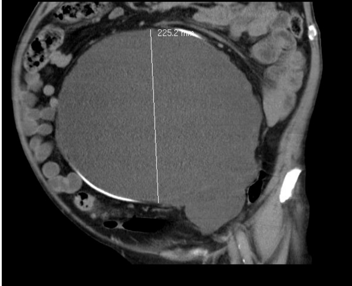
Figure 3 Computed tomography scan of giant lymph cyst.

Pelvic and retroperitoneal lymphoceles may cause venous obstruction with subsequent edema and thromboembolic complications. Large lesions cause abdominal distension, and pain may become unbearable as the lymphoceles fill much of the abdomen.