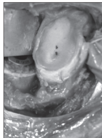
Figure 1: The starting point for baseplate insertion in Group 1 was the center of the glenoid, which was identified based on the measured midpoint between the superior/inferior and anterior/posterior margins of the glenoid. Baseplates in Groups 2 and 3 were placed 2 mm inferior to the center of the glenoid

Tensile testing was done on all 24 specimens to quantify deltoid elongation and evaluate failure. To aid in gripping the specimen,