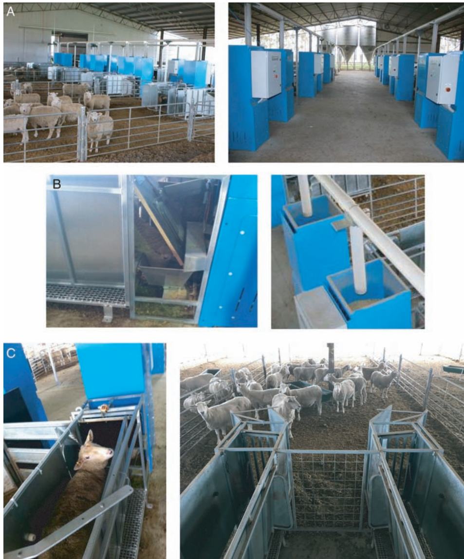
Figure 1. (a) Automated sheep feeding facility showing each pen contains 2 feeders. (b) Storage feed hopper and overhead centerless auger to deliver feed to each hopper and stainless-steel feed bin showing RFID feeder flap and a sheep eating from the feed trough. (c) Approach race configuration showing entry and exit gates and proximity sensor location.

The automated feeding system (Figure 1a) consisted of 20 feeders in 10 pens (2 feeders per pen), which was controlled using Feeder Management Software (FMS). All control processes were managed through the FMS coded in Sequel (SQL—Structured Query Language) by ZI-Argus Australia (Clayton, Victoria, Australia). The FMS software used program logic control to create individual animal feed events under ad libitum feeding conditions and managed data acquisition and storage. Feeding plans for individual animals and the weight of feed to be maintained in the feed bin between feed events