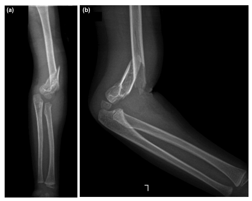
Fig. 1: (a) Initial post-traumatic anteroposterior and (b) lateral radiographs of the left elbow showing ipsilateral fracture of the distal shaft humerus and supracondylar with complete displacement.