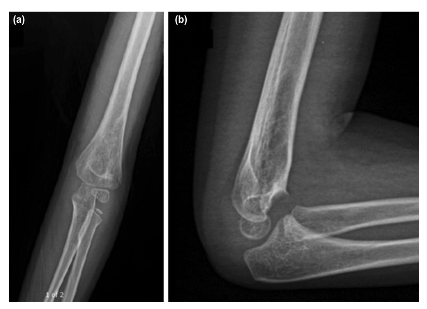
Fig. 3: Final follow-up radiographs at 10 months. (a) Anteroposterior and (b) lateral of the left elbow demonstrating complete fracture healing.

asymptomatic, and the elbow arc of flexion–extension was 0^{\circ} to 130^{\circ} (Fig. 3).