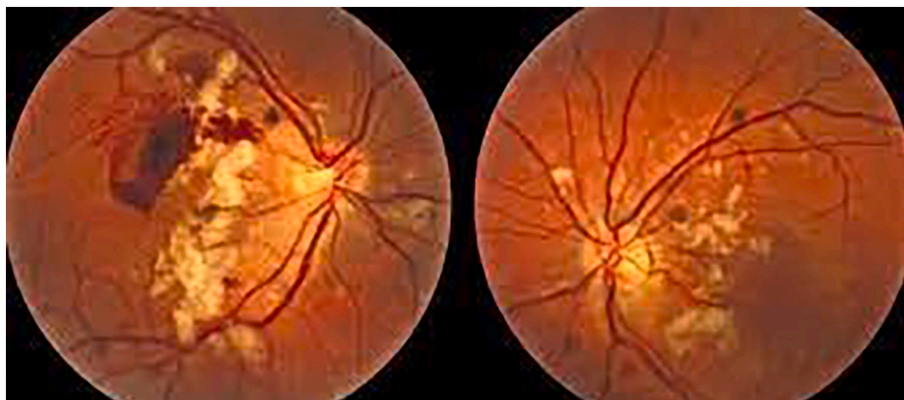
Fig. 1. Retinal fluorescein angiography.

There are no consensual guidelines on the therapeutic approach [43,44] and the treatment can be difficult due to the underlying life-threatening pathology. In the majority of cases, the acute lesions resolve spontaneously within 1–3 months from the appearance. Nevertheless, there are some reports on successful treatment with