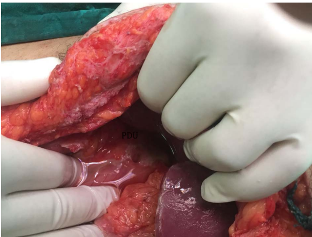
Figure 2: 2-cm ulcer appeared on the anterior aspect of the first part of the duodenum.

nasogastric tube and no leakage was found. The postoperative course was uneventful, and contrast study was done on the seventh day postoperatively showing no contrast leakage and the patient was discharged.