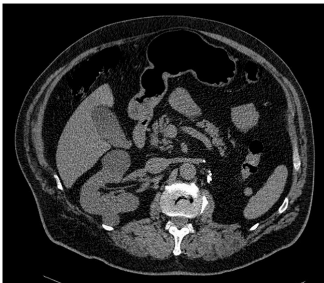
Figure 1 Axial CT demonstrating a right renal mass in a patient who has previously undergone left nephrectomy and right PN for RCC. Following successful OPN with renal hypothermia, eGFR stabilized to 45 mL/min/1.73 m 2 post-operatively. CT, computerized tomography; PN, partial nephrectomy; OPN, open partial nephrectomy; RCC, renal cell carcinoma.