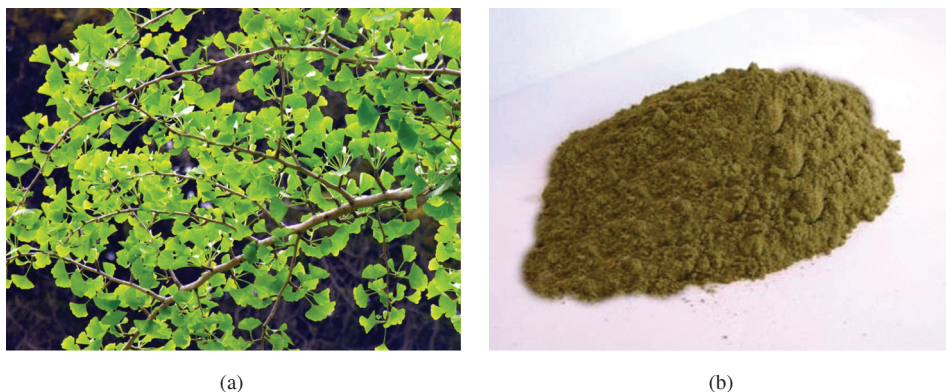
FIGURE 1: (a) Ginkgo biloba ; (b) leaves powder.

the agar plates. After 5 min the plates were incubated at 37°C for 24 h. Gentamycin (30 mg), erythromycin (15 mg), and ampicillin (10 mg; Central Drug House Ltd., New Delhi) were used as positive controls and the respective solvent as negative control. After 24 h of incubation, the diameter was observed for zone of inhibition, ZOI (measured in mm including disc size). All tests were performed in triplicate and observed values of ZOI are expressed as mean value with standard error of means (SEM).