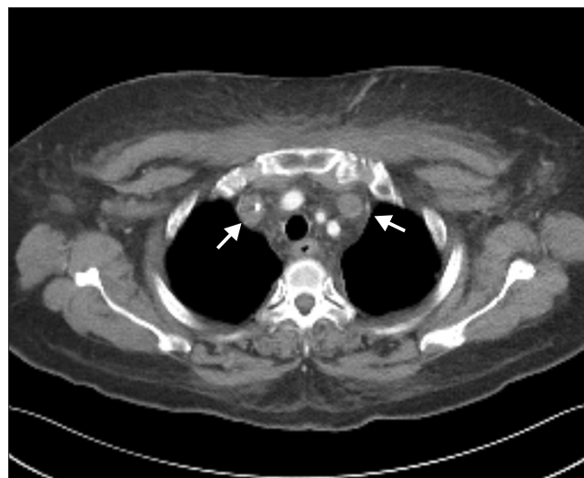
Figure 2. Axial computed tomography images of the thorax show enlarged bilateral internal jugular veins and thrombosis (arrows).

Despite the intensive medical therapy, the swelling in the face and both arms progressed along with significant leukocytosis with a left shift. On day 8, an enhanced chest CT scan was performed for differential diagnosis, showing extensive occlusive thrombi within the bilateral internal jugular, subclavian and brachiocephalic veins and SVC with lung adenocarcinoma in the left apex and decreased metastatic lesions (Figure 2). CDT, aspiration thrombectomy and SVC endovascular stent placement were performed with 5,000 units of heparin and 500,000 units of urokinase and followed by the overnight infusion of 1,000,000 units of urokinase to relieve the patient's symptoms. Follow-up venography showed residual thrombi