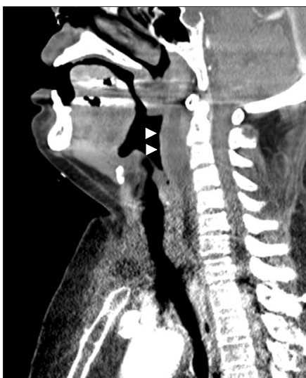
Figure 1. Sagittal images from an initial contrast-enhanced neck computed tomography scan show a retropharyngeal abscess (arrowheads).

A 63-year-old female presented with dysphagia and facial swelling for 3 days. She had been diagnosed with hypertension and had undergone total thyroidectomy and total hysterectomy due to papillary thyroid carcinoma and endometrial carcinoma, respectively, 10 years prior. She had diagnosed with the adenocarcinoma of the lung (stage IV) 4 months ago, and completed six cycles of cisplatin and pemetrexed chemotherapy 2 weeks previously. During the chemotherapy, she exhibited stable disease for adenocarcinoma. At admission (day 1), hyperemia and swelling of the posterior pharyngeal wall were observed. All vital parameters were stable and normal, except for tachycardia (115 bpm). An arterial blood gas showed pH 7.41, PaCO 2 19.1 mm Hg, PaO 2 137.8 mm Hg, and HCO 3 - 11.8 mEq/L, consistent with a chronic compensated respiratory alkalosis with metabolic acidosis along with increased anion gap. White blood cell count ( 6.3 \times 10^3/\mu\text{L} ), hemoglobin level (13.1 g/ \mu\text{L} ), platelet count ( 1.23 \times 10^3/\mu\text{L} ), erythrocyte sedimentation rate (32 mm/hr), and C-reactive protein (1.44 mg/dL) were unremarkable. Routine biochemistry was normal except serum glucose level (426 mg/dL) and glycated hemoglobin level (8.8%). She was newly diagnosed with diabetes, and started on multiple subcutaneous insulin injections.