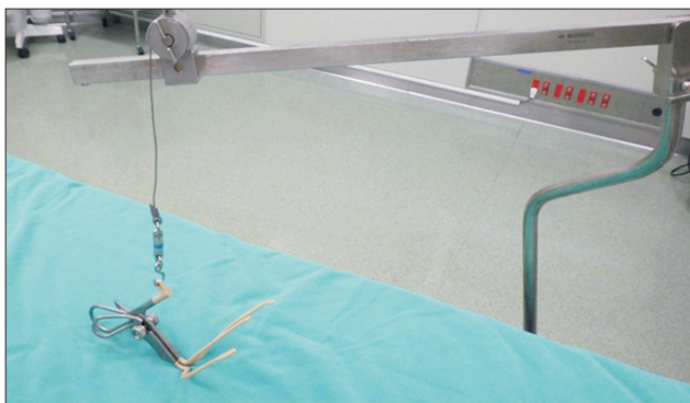
Fig. 1. A fan-shaped retractor is shown.

Demographic details (age, sex, BMI), history of pancreatitis, malignant disease, serum albumin level, coexisting diseases such as diabetes mellitus, hypertension, American Society of Anesthesiologists (ASA) physical status (PS) classification, and steroids-use were collected and evaluated as preoperative characteristics.