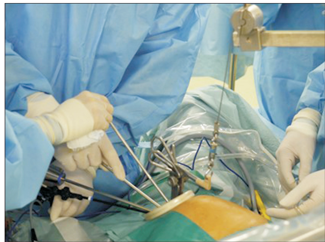
Fig. 2. One grasper and two dissectors were used through one port in the umbilicus.

Next, the gallbladder was retracted at the fundus and approached from the Calot triangle. The cystic duct and choledochus were identified with a grasper while retracting the fundus, and the cystic duct and artery were partially exposed. A right angle-type dissector was used to expose the cystic duct and