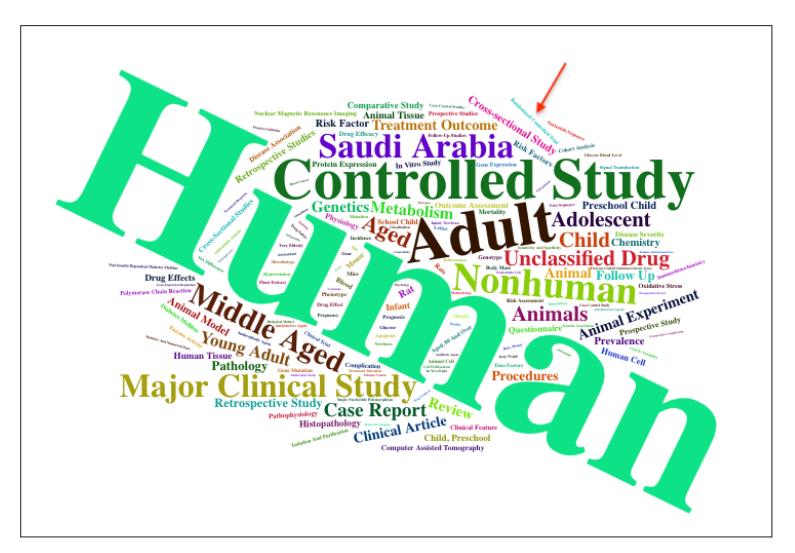
Figure 3. Word cloud of most frequent keywords in Saudi health-related articles in the Scopus database (larger font size indicates more frequent term).