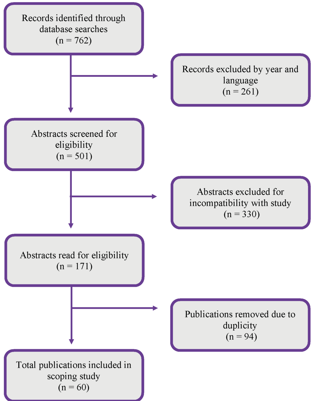
Fig 1. Study selection process.

https://doi.org/10.1371/journal.pone.0196347.g001