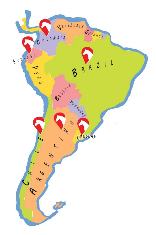
Figure 1. Geographical localization of the countries where EIV was reported in South America.