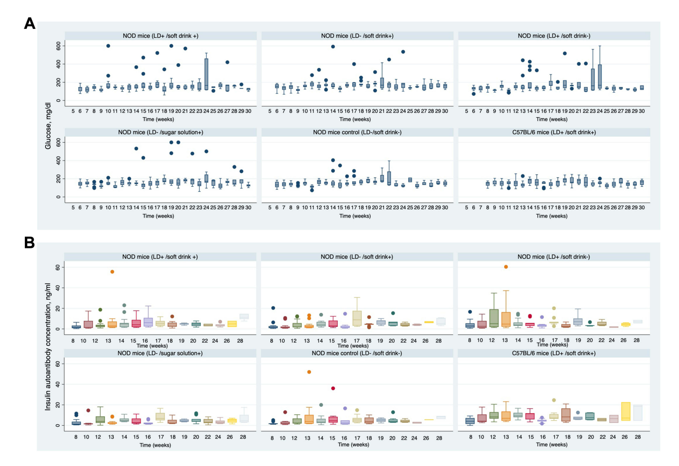
Figure 5 Panel (A-B) shows the weekly changes in blood glucose and Insulin autoantibody (IAA) development in LD alteration compared to NOD control group.

(UPR) leading to the activation of pro-apoptotic signalling pathways, ultimately resulting in \beta -cell death.<sup>47–49</sup> Future studies should investigate the specific mechanisms by which LD alteration interacts with the diabetic state to elevate corticosterone and explore its potential role in different pathways leading to T1DM development in NOD mice.