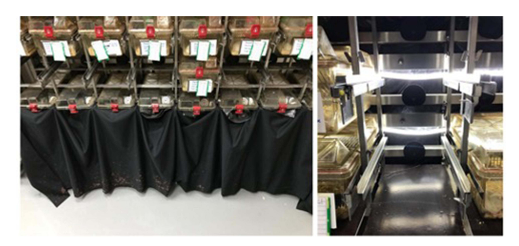
Figure 2 Light dark cycle Alteration setup. The cages at the bottom were covered with a black cover to ensure isolation from the room's ambient L/D conditions. The lamps were installed behind the mice cage racks and were connected to a separate 24-hour timer, set for a cycle of 10 hours light and 10 hours dark.

Mice were exposed to a light/dark (LD) cycle alteration using the T-20 method, which entails 10 hours of light followed by 10 hours of dark.<sup>17,18</sup> Each chamber was illuminated using solid-state, electromagnetic fluorescent ballasts with rapid-start, cool-white lamps. These lamps were installed behind the mice cage racks and were connected to a separate 24-hour timer, set for a cycle of 10 hours light and 10 hours dark. To ensure isolation from the room's ambient LD conditions, cages were covered with a black cover (Figure 2). The experimental groups were as follows: