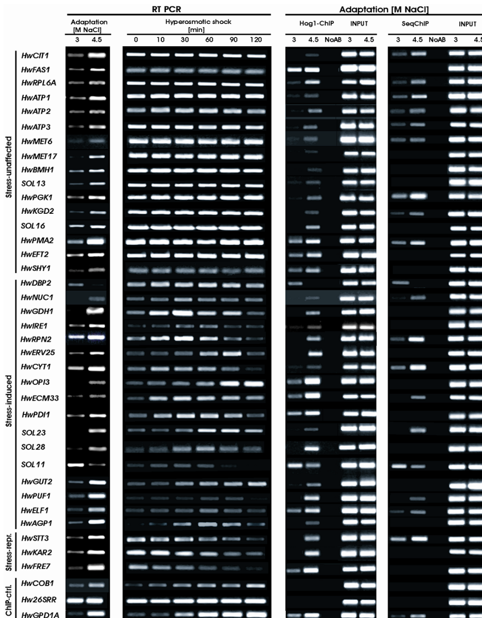
Figure 2 Expression profiles of HwHog-ChIP positive genes in adapted and stressed H. werneckii cells and ChIP results in adapted cells. RT-PCR was performed with RNA isolated from adapted cells (Adaptation) or cells exposed to hypersaline stress (Hyperosmotic stress) as indicated. 26S rRNA ( Hw26SRR ) was used as an internal control for template normalization. The HwHog1-ChIP and sequential RNA polymerase II/HwHog1-ChIP (SeqChIP) results for cells adapted to 3 M NaCl and 4.5 M NaCl are presented in parallel. The negative control for nonspecific binding of antibodies in both ChIP experiments is represented in the "NoAB" line and the positive control for genomic DNA amplification from 100-fold diluted input samples is labeled as "INPUT". HwCOB1 and 26SRR genes were negative controls and HwGPD1A was the positive control for HwHog1 and RNA polymerase II cross-linking.