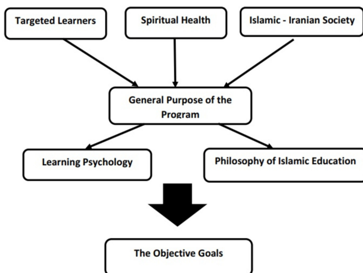
Fig. 2. Iranian spiritual health curriculum approach

Islamic spiritual health curriculum is based on 3 important sources of goal extraction. The program emphasizes the role of Islamic-Iranian culture and Islamic values and beliefs. According to education experts, the birth of spirituality is done through the implementation of a spiritual curriculum. Spiritual education results in the growth of abilities, inner and exterior skills, being and achieving perfection, and serving God (27). Feeling and being is the result of spiritual health education in the Islamic dimension that gives meaning to life. Since spirituality is a subject of education and the field of education is the best opportunity for the development of the spiritual dimension of man, it is necessary to devise a plan based on the cultural context of society. In this study, a strategy that might be used to educate Islamic spiritual health was attempted to be extracted from the numerous texts that adhere to Tyler's curriculum model. This approach is shown in Figure 2. Therefore, the Islamic spiritual health curriculum includes elements of goals, content, training, and evaluation that can generate the attitudes, or interpreters of Quran-endorsed Islamic spirituality in human beings. The Islamic spiritual health curriculum is a comprehensive program that takes into account both learners' interests, needs, and wants as well as religious theoretical underpinnings including religious concepts (27).