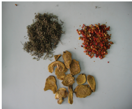
FIGURE 1: Prepared herbal medicines of Yinchenhao Tang.

Synergism is a key principle of TCM [9], and understanding the synergistic effects of YCHT represents an even greater challenge than usual. Fortunately, its mode of function can be revealed using modern biochemical analyses. YCHT can be analyzed using chemical fingerprinting, pharmacokinetics, and systems biology approaches, promising new schemes and patterns of advancing drug development from active constituents of Chinese medical decoction.