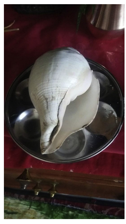
Fig. 1. Conch: Conch is shell of sea snail, it is popularly used in hindu culture as a musical instrument.