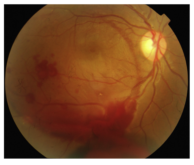
Fig. 4. Clearing of haemorrhage within few hours.

superficial retinal capillaries, leading to hemorrhagic detachments of the internal limiting membrane. The blood is usually localized to the sub-internal limiting membrane (ILM) space and/or the sub-hyaloid space. If blood is trapped in both spaces, it presents a "double-ring sign." The outer and inner rings represent subhyaloid and sub-ILM bleed, respectively.<sup>2</sup>