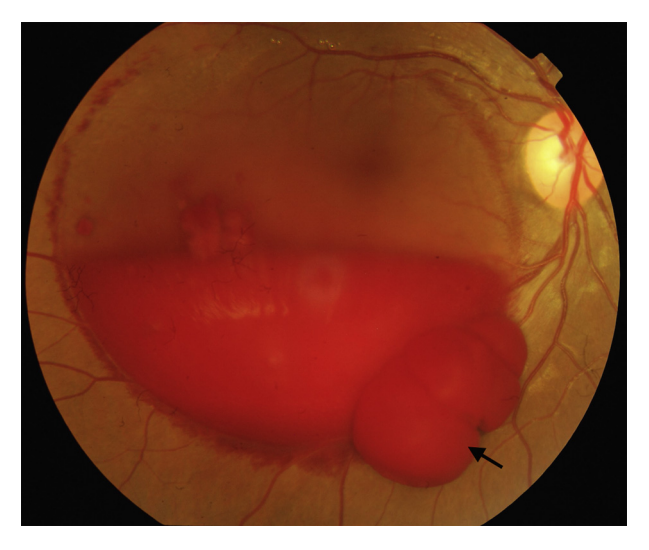
Fig. 3. Fundus photo after yag membranotomy: blood trickling down from the site of membranotomy (black arrow).

Valsalva retinopathy occurs in young healthy adults following a valsalva maneuver.<sup>2–5</sup> During a valsalva maneuver, a rapid increase in thoracic venous pressure occurs, which can lead to rupture of the