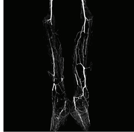
FIGURE 3: MR angiogram showing bilateral anterior and posterior tibial artery occlusion with some collateral vessels.

In the laboratory investigation, he had a normal blood cell count with normal differentiation. His C3, C4, HBs Antigen, HCV and HIV antibodies, antineutrophil cytoplasmic antibodies (anti MPO and PR3), antinuclear antibodies (Elisa), rheumatoid factor, anti-CCP, anticardiolipin antibodies (Elisa), protein C and S, antithrombin III, factor IV Leiden, prothrombin and thrombin time, partial thromboplastin time, homocysteine, cryoglobulins, cryofibrinogen, and renal and liver function tests were all normal. His CH50 showed some degrees of decreased activity (68%), and the erythrocyte sedimentation rate (Westergren method) was around 24/min on average.