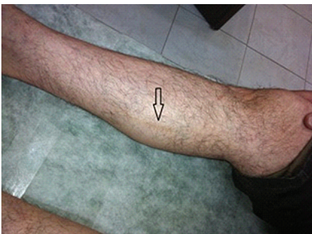
FIGURE 2: Superficial phlebitis of right shin.

present illness, he complained of excessive sensitivity to the cold exposure of his extremities and showed features highly suggestive of Raynaud's phenomenon. He had no history of diabetes, hypertension, dyslipidemia, or any other comorbid condition.