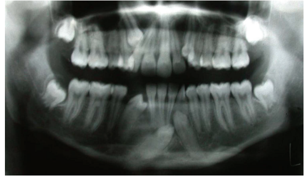
FIGURE 3: Panoramic radiograph showing 43 transmigrating towards left side.

The permanent canines are the only teeth in which transmigration have been reported [6]. The larger cross-sectional