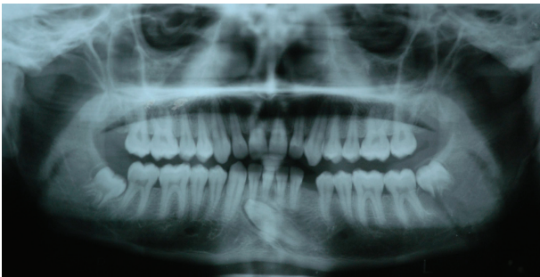
FIGURE 2: Panoramic radiograph showing transmigrated 33 lying below the apices of mandibular incisors.

fracture extending from inferior border of mandible to developing tooth bud of 38. 33 was found to be crossing the midline and was below the apices of mandibular incisors with no evidence of any pathology or root resorption.