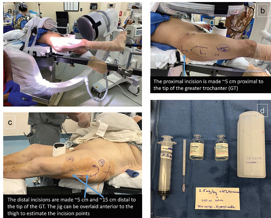
FIGURE 2: Preoperative preparation for monitored anesthesia care and soft-tissue infiltration of local anesthetic (MAC-STILA)

a) Patient positioning for short cephalomedullary nailing (CMN). b) Landmarks marked for short CMN incisions, as well as targets for the STILA corresponding to the nail entry point to the greater trochanter, the head lag screw, and the distal interlock screw. c) Similar landmarks for a different patient for a left hip. d) Supplies required for STILA: 2.5 mg/kg of 0.25% bupivacaine, 22-gauge spinal needle, 50-60 cc syringe, 0.9% normal saline.