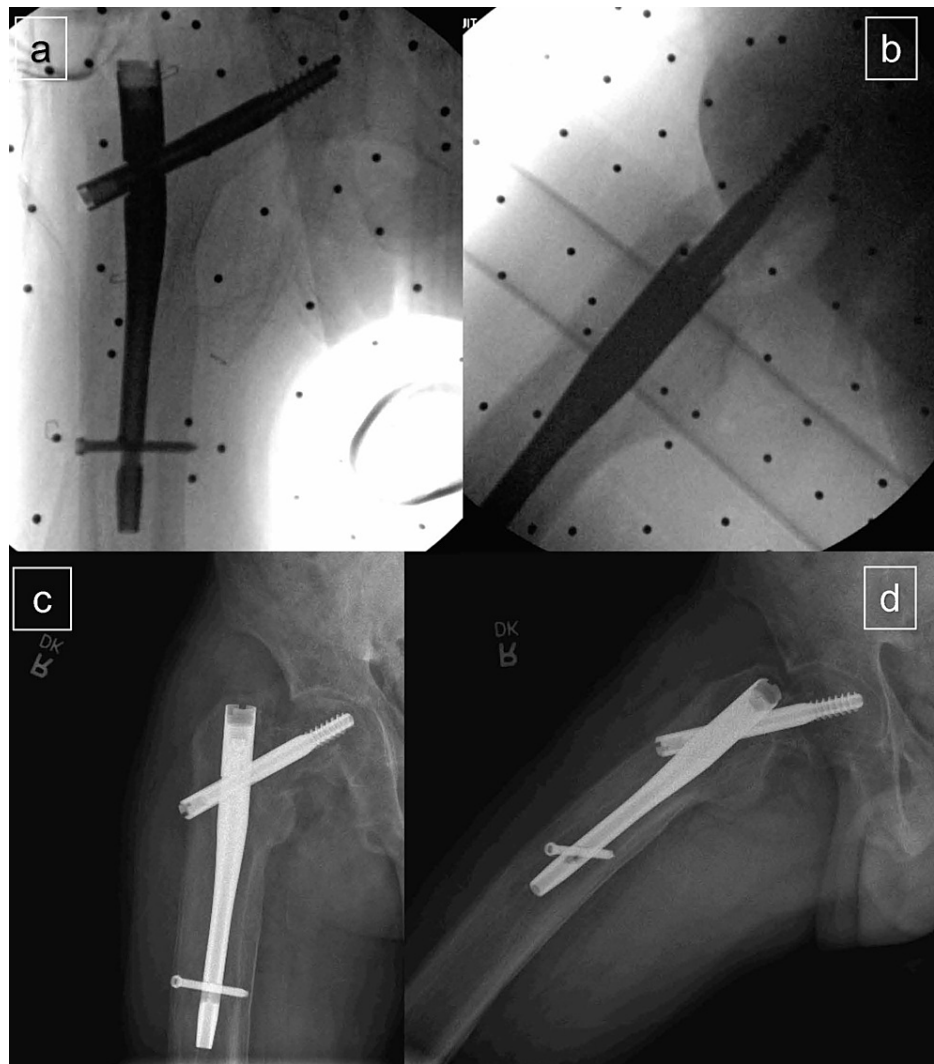
FIGURE 4: Post-operative fluoroscopy images after short cephalomedullary nailing anteroposterior (AP) (a) and cross-table lateral (b). One-year follow-up AP (c) and cross-table lateral (d) radiographs