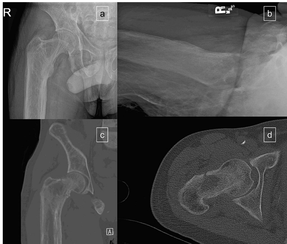
FIGURE 1: Preoperative radiographs (a and b) and CT scans (c and d) of a right basicervical (OTA/AO 31-B2.1) femoral neck fracture. Note the osseous abnormalities resultant from the patient's renal osteodystrophy.