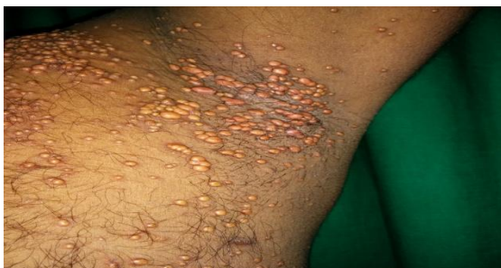
Fig 2: Multiple yellow to reddish-brown papules and nodules grouped together over the left axilla.

Examination of the oral cavity revealed multiple yellowish papules and nodules over the buccal mucosa, gingiva, and palate. Video laryngoscopy was performed in view of hoarseness which showed multiple yellowish nodules over the base of the tongue, vallecula, laryngeal surface of the epiglottis, ary-epiglottic folds, interarytenoid region, and subglottic region (Fig. 3).