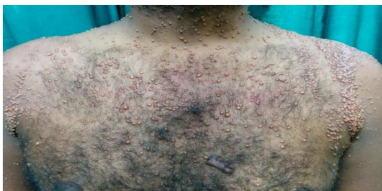
Fig 1: Multiple discrete yellow to reddish-brown papules and nodules present all over the anterior trunk with lesions over the bilateral shoulder coalescing to form plaques and giving a band like appearance.

A 35-year-old male came to our clinic with numerous, yellow to reddish-brown elevated lesions all over his body for the last three months and with hoarseness of voice for the last two months. Lesions appeared insidiously, initially over the axilla and gradually involved the shoulder, face, scalp, groin and genitalia. There was no history of smoking or hypothyroidism. His family history was noncontributory. There was no history suggestive of nervous system involvement. Cutaneous examination revealed multiple discrete yellow to reddish-brown papules and nodules all over the body. The lesions over flexures and bilateral shoulders were grouped and coalescing to form plaques (Fig1,2).