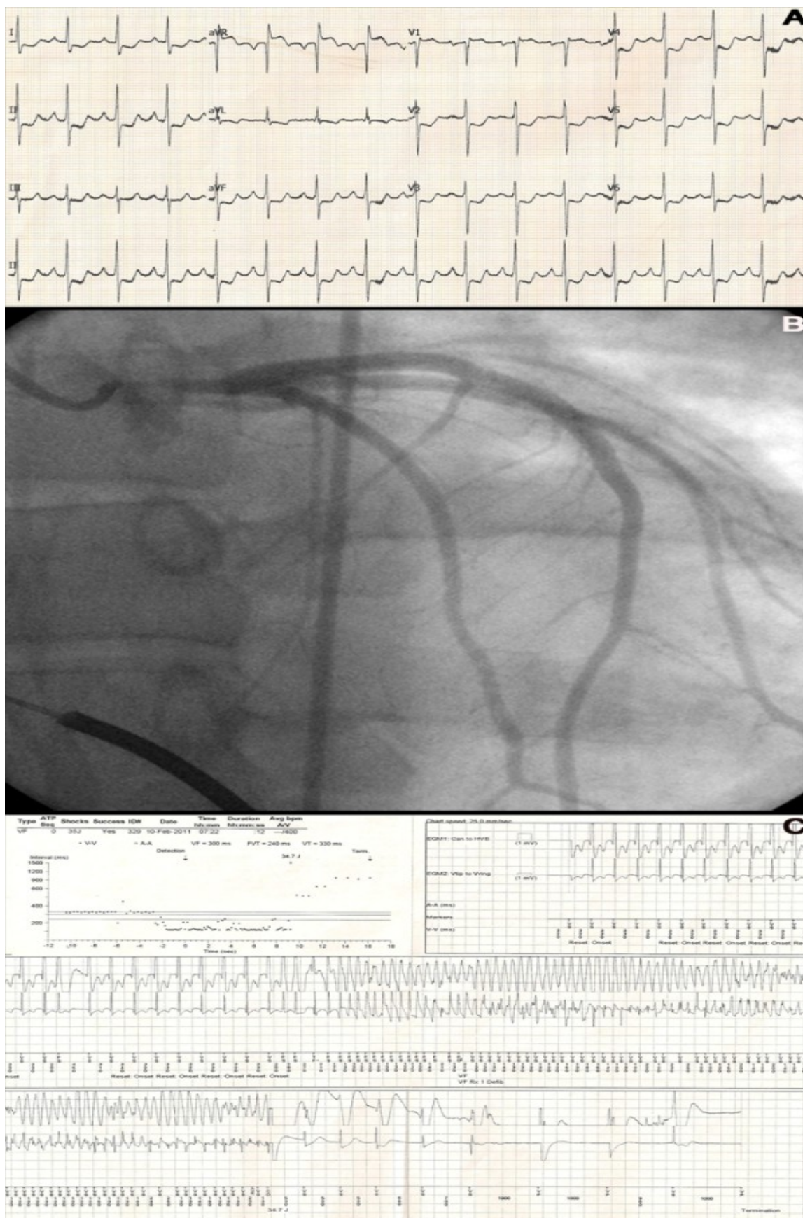
Figure 3. A: 12-lead electrocardiogram (ECG) demonstrating global ST depression B: Coronary angiography showing 95% left main stent thrombosis. C: Interval plot and stored electrogram showing appropriate device therapy due to ventricular arrhythmia (VF).