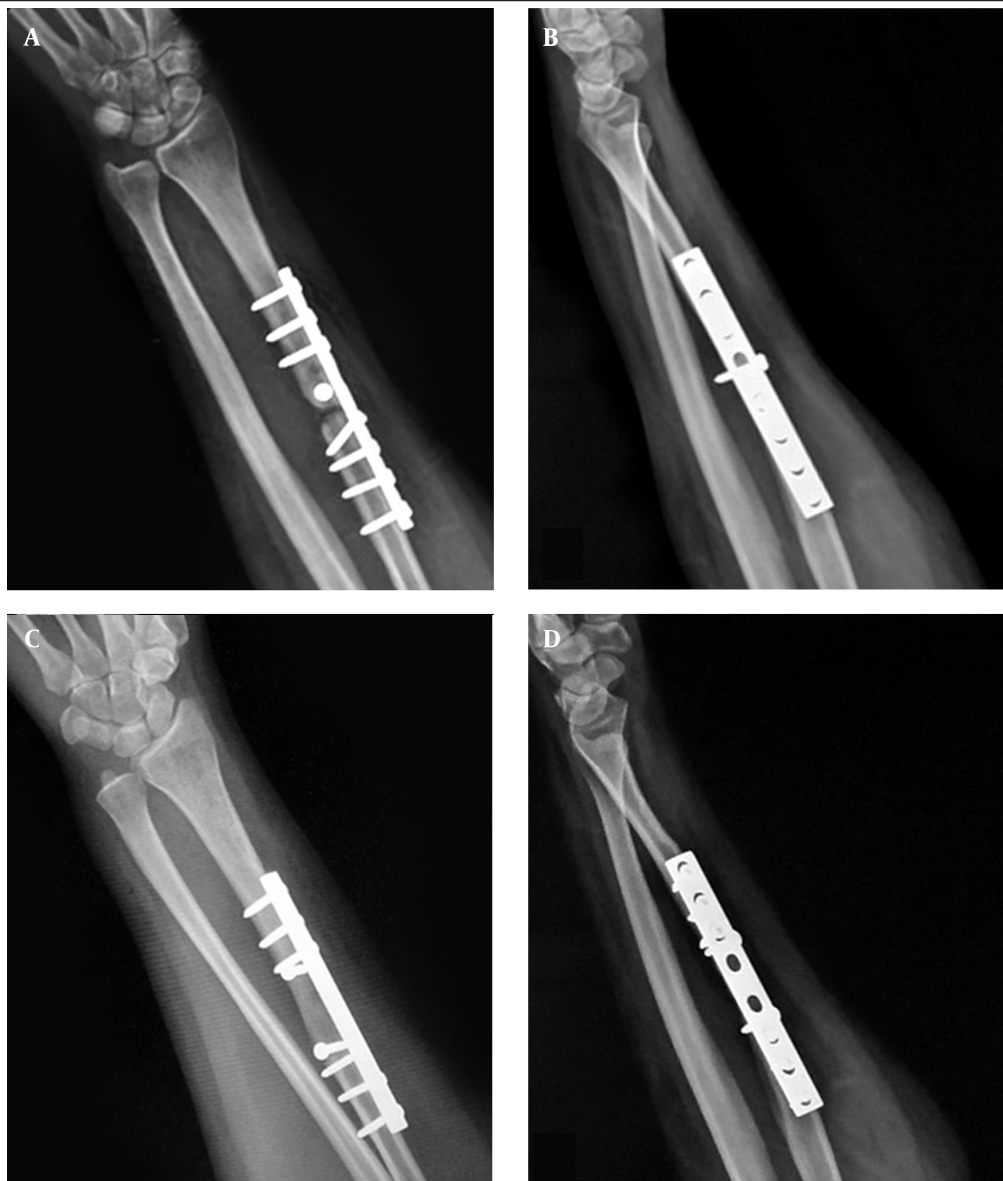
Figure 3. Preoperative anteroposterior (A) and lateral (B) X-rays of case 7 of a nonunion of the previous isolated radius fracture 12 months ago. Three months after radial fixation, the bone flap united. Anteroposterior (C), lateral (D) X-rays at the final follow-up (7 months after surgery) demonstrated complete healing of both fracture site and donor site.

Regional antegrade RFBF was performed for nonunion of 4 ulnar and 3 radial bones. Donor site of the flap on the radius was filled by cortico-cancellous bone graft from the iliac bone only in the first three patients. The average length of the graft was 39 (range: 30- 45) millimeters. The mean duration of follow-up was 34 (range: 7- 80) months. All of nonunions united in an average time of 3.8 (range: 3 - 6) months (Figure 3).