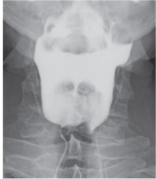
FIGURE 3: Postoperative barium swallow portraying marked improvement in the contour of the pharynx since the previous study with only mild residual ectasia of the superior lateral left wall of the pharynx.

swallow was performed. Imaging revealed bilateral moderately sized diverticuli that altered in size during differing phases of swallow (Figure 1). The diverticuli were located higher and more lateral than expected for the known types of pouches, prompting a CT scan of the neck with oral contrast (Figure 2) to determine the anatomy of the diverticuli in relation to the neck structures. The CT scan portrayed the pharyngeal pouches to be 17 mm in diameter and arising between the hyoid bone and thyroid cartilage.