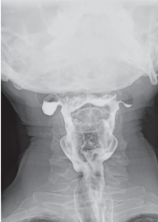
FIGURE 1: Preoperative barium swallow showing two moderate-sized diverticula.