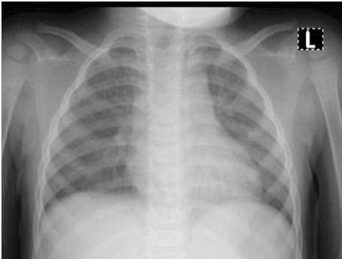
Figure 1: patient one chest radiograph showing bilateral patchy opacities seen in both lung fields