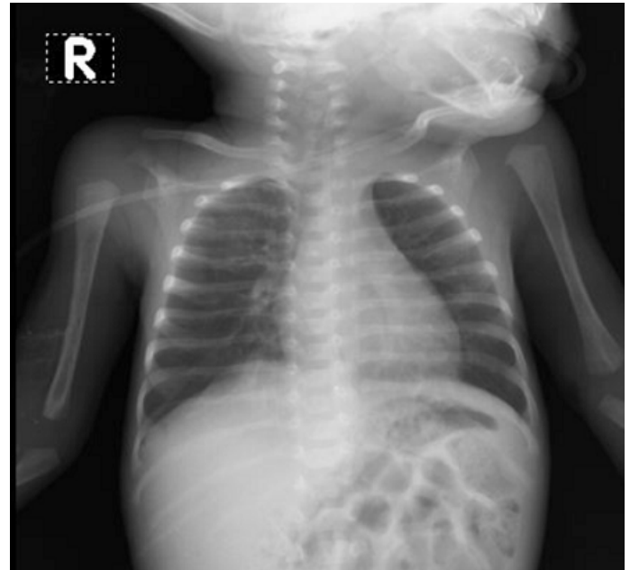
Figure 4: patient 5 chest radiograph showing normal study

illness revealed normal (Figure 4). We revised the diagnosis to moderate COVID-19, and he received tabs zinc, azithromycin and lopinavir/ritonavir with remarkable improvement in the clinical states.