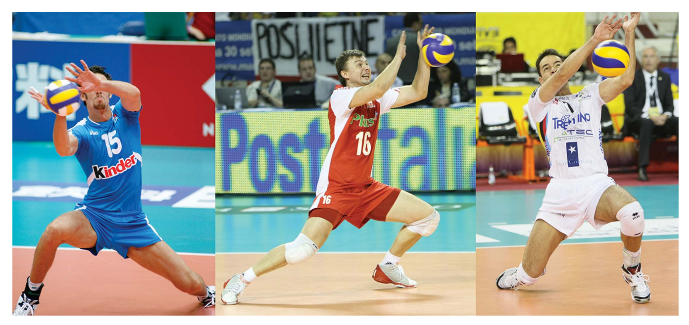
Figure 3 Overhand defensive techniques are frequently used in the back court, leading to a risk of finger injuries, particularly among libero players.

spread fingers.<sup>15</sup> <sup>16</sup> However, it should be noted that rule changes have led to the development of new effective defensive techniques, the overhand dig, a common and effective defensive action used to stop hard-driven spikes in the back court (figure 3). This has been described as an additional mechanism for finger injuries in beach volleyball.<sup>27</sup>