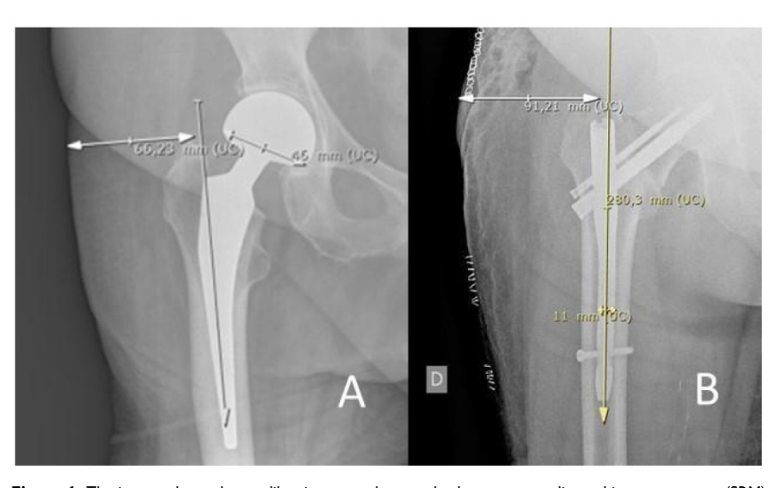
Figure 1. The images above show calibration procedures and subcutaneous radiographic measurement (SRM) assessment. Figure 1A shows measurement for hemiarthroplasty and figure 1B for an IM nail. First, a parallel line to the femoral diaphysis was drawn. In figure 1A, a known measure was introduced as a reference for the dome component (in this case 46mm). In figure 1B, the nail diameter was used as a reference (11mm). Following this calibration procedure, a perpendicular line to the femoral diaphysis was drawn from the tip of the greater trochanter and the distance to the skin from this point was measured.

In the univariate analysis, distribution of previously studied risk factors between cases and controls did not show significant differences except for patients with an ASA score of 3 and subcutaneous radiographic measurement. (Table 1) The odds ratio (OR) for infection of