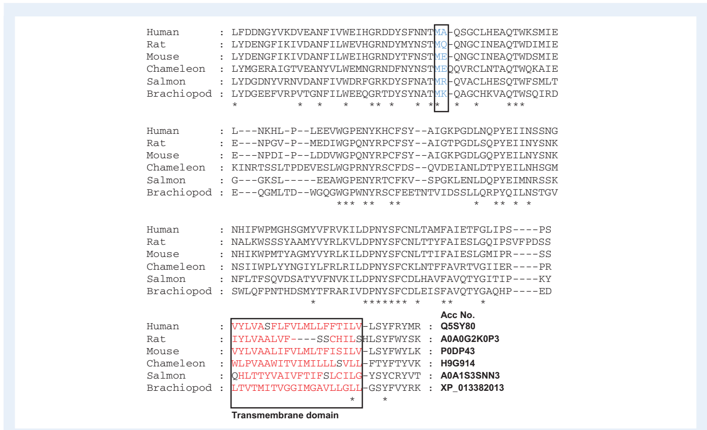
Figure 3 Alignment of a truncated region of CatSper-epsilon protein sequences (corresponding to 769aa–931aa of human CatSper-epsilon). Five selected evolutionary distant species were compared to the Human sequence using the EBI MUSCLE program. Stars (*) indicate conserved amino acids. The box with the blue lettering indicates the evolutionary conservation of the predicted deleted MA region in CatSper-epsilon of the patient 1 (p.Met799_Alal800del). The box containing red lettering illustrates a high density of hydrophobic amino acids that is the predicted transmembrane domain of the CatSper-epsilon orthologous proteins. The Uniprot or Genbank Accession numbers (Acc No.) for the different CatSper-epsilon proteins are given.

These initial observations show an association between a CatSper-epsilon variant and loss of CatSper channel function. Proof that this variant is the exclusive reason for the loss of channel function and fertilization competence will require further evidence. Generation of an equivalent CATSPERE mouse model is a conventional strategy and is potentially useful but a fundamental issue is that nothing is known