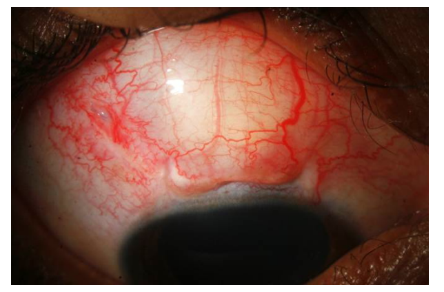
Figure 4: Final slit lamp photograph showing well formed bleb