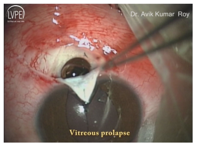
Figure 2: Fundus photograph showing combined choroidal detachment and serous retinal detachment superiorly

dropping to counting finger at 2 meters and IOP being still non-recordable. He was treated with topical prednisolone drop at 2-hourly intervals plus oral prednisolone at 1 mg/kg/day dosage. The effusion settled in 2 weeks time after which the steroids were gradually tapered. Gradually the vision and IOP got improved. At the last follow up visit after 3 months, the best corrected visual acuity and IOP were 20/25 and 12 mm Hg off any medication, respectively (Figure 3, Figure 4).