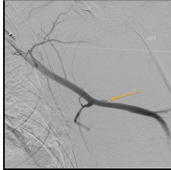
Figure 5. Digital subtraction angiography, after thrombin injection. A very small remnant of PSA appears (arrow).

gioplasty balloon was inflated, and lack of flow within the PSA was confirmed by color Doppler imaging. Reconstituted bovine thrombin (500 U/mL) was directly injected into the PSA, and the balloon was left inflated for one minute. This was repeated several times, with progressive thrombosis of the body of the PSA from distal to proximal