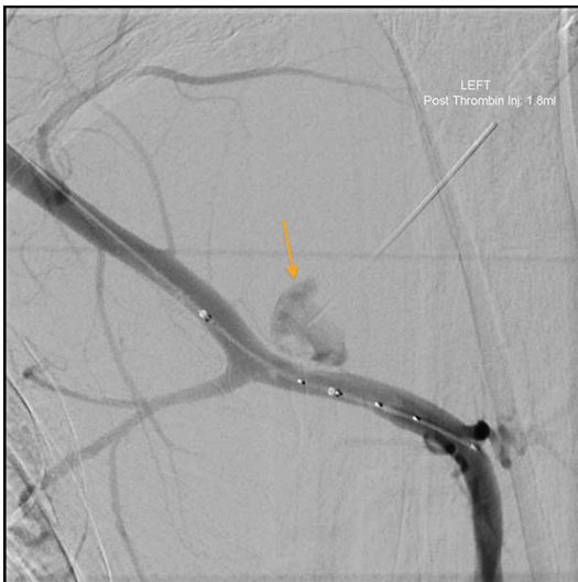
Figure 4. Digital subtraction angiography. Partially occluded PSA, as seen between cycles of thrombin injection, as evidenced by the decreasing lumen size (arrow).

gioplasty balloon was inflated, and lack of flow within the PSA was confirmed by color Doppler imaging. Reconstituted bovine thrombin (500 U/mL) was directly injected into the PSA, and the balloon was left inflated for one minute. This was repeated several times, with progressive thrombosis of the body of the PSA from distal to proximal