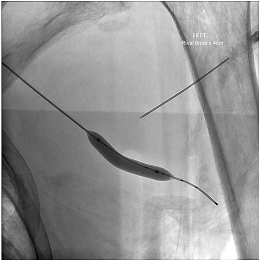
Figure 3. Axial fluoroscopy. Demonstration of balloon occlusion and percutaneous placement of the 21-gauge micropuncture needle into the medial and cephalad portion of the PSA.

A 6-mm x 4-cm angioplasty balloon was positioned along the area of injury (Fig. 3). Using ultrasound guidance, a 21-gauge micropuncture needle was inserted percutaneously into the medial and cephalad portion of the PSA. The an-