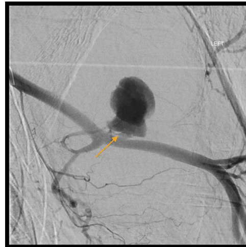
Figure 2. Digital subtraction angiography, before thrombin injection. A narrow neck (arrow) can be seen, decreasing the risk of downstream embolization.

Access was obtained via the right common femoral artery, using a 21-gauge micropuncture needle with placement of a 5 French vascular sheath. Flush aortography demonstrated a three-vessel aortic arch without atherosclerosis and a widely patent left subclavian artery without injury. Redemonstration of the axillary artery PSA, originating from the proximal portion of the artery and projecting in a cephalad direction, was noted (Fig. 2). An angled, tapered catheter was used to cannulate the subclavian and axillary arteries, and dedicated imaging of the lesion was obtained.