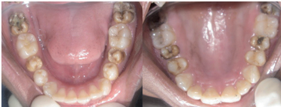
Fig. 1. Intraoral photograph showing clinical status of teeth.

tivity in his teeth. His parents wanted to him to undergo dental treatment before taking him abroad for corneal transplant (also a sequela of SJS). On obtaining detailed history, it was revealed that the boy had suffered from an acute adverse drug reaction after taking a course of amoxicillin, which was advised by a physician when the child was seven years old. He developed fever with generalised erythema and desquamation of skin along with painful ulcerations in the mouth and eyes. He was then referred to another physician who diagnosed the condition as SJS. The patient was hospitalised for around one month and was administered hydrocortisone among other drugs to control the reaction. According to the child's parents, while the skin lesions healed and other problems resolved, vision could not be restored. They were now planning for a corneal transplant, which had been suggested for restoration of the child's vision. On intraoral examination, the patient had all the teeth erupted up to second molars in both the arches (Fig. 1).