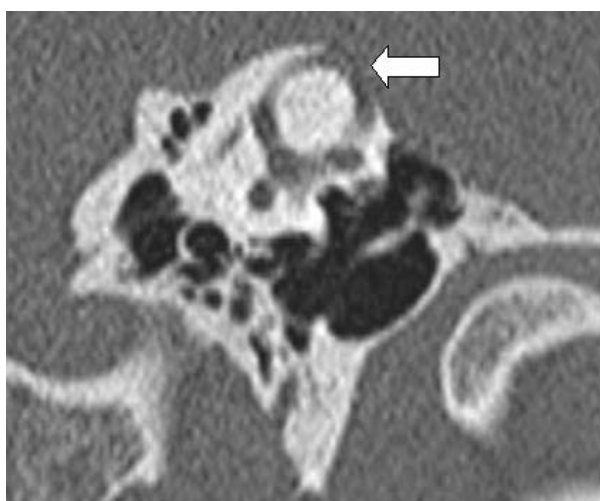
Figure 2 High-resolution CT scan showing a left superior semicircular canal dehiscence (arrow).

Acoustic reflexes and vestibular evoked myogenic potentials (VEMPs) aid in the identification of patients with an apparent conductive hearing loss with normal acoustic reflexes or those patients who are found to have an asymptomatic dehiscence on radiology [4]. The treatment involves avoidance of the precipitating stimuli [5].