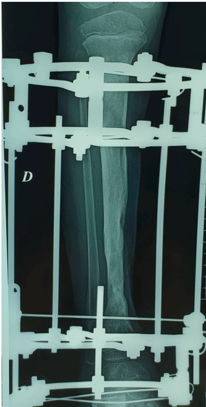
Fig. 5. X-ray at 8 months of Ilizarov external fixator: the quality of the bone formed allows the fixator to be removed.

report represents a retrospective study, single-center series and a limited case series. The experience of more groups is mandatory to gather enough clinical evidence regarding this issue.