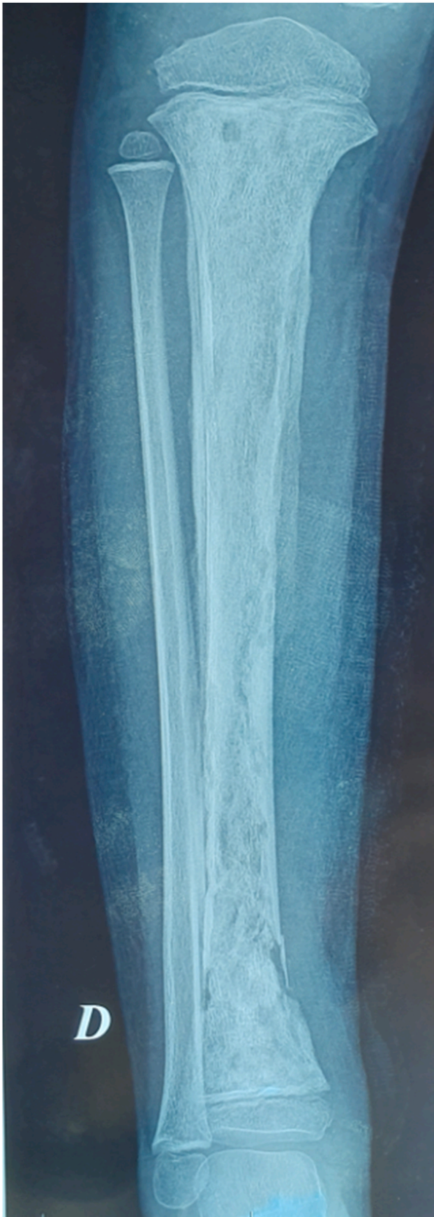
Fig. 1. X-ray of the right tibia: pathological fracture with extensive bone destruction following acute osteomyelitis.