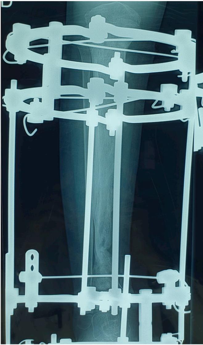
Fig. 3. Bone consolidation underway 3 months after placement of the Ilizarov external fixator and antibiotic therapy.

high in our setting, 20% isolates of S. aureus . The rate of MRSA acquired in the community is increased in the United States of America [7,11], but in Europe is still low and less than 2% [12].