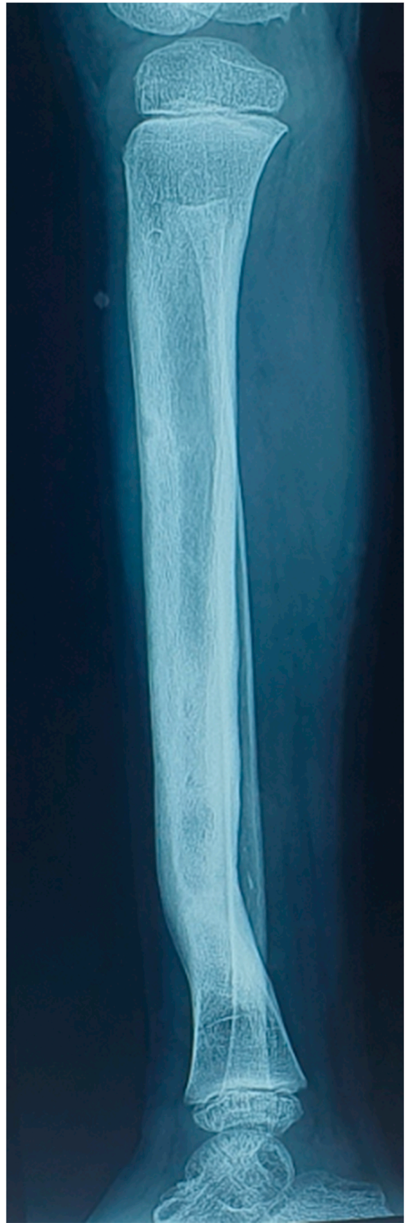
Fig. 8. Profile x-ray of the right tibia: bone union after 10 months of treatment.