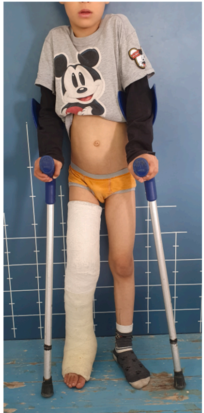
Fig. 6. Plaster cast with permission to walk.

The Ilizarov external fixator associated with antibiotic therapy represents an effective and safe solution for the management of acute hematogenous osteomyelitis of long bones complicated by pandiaphysitis with extensive bone lesions. It helps to preserve the bone capital of the child and guide bone consolidation. This strategy makes us the most effective and the least expensive in the management of a pathology that is relatively common in poor countries.