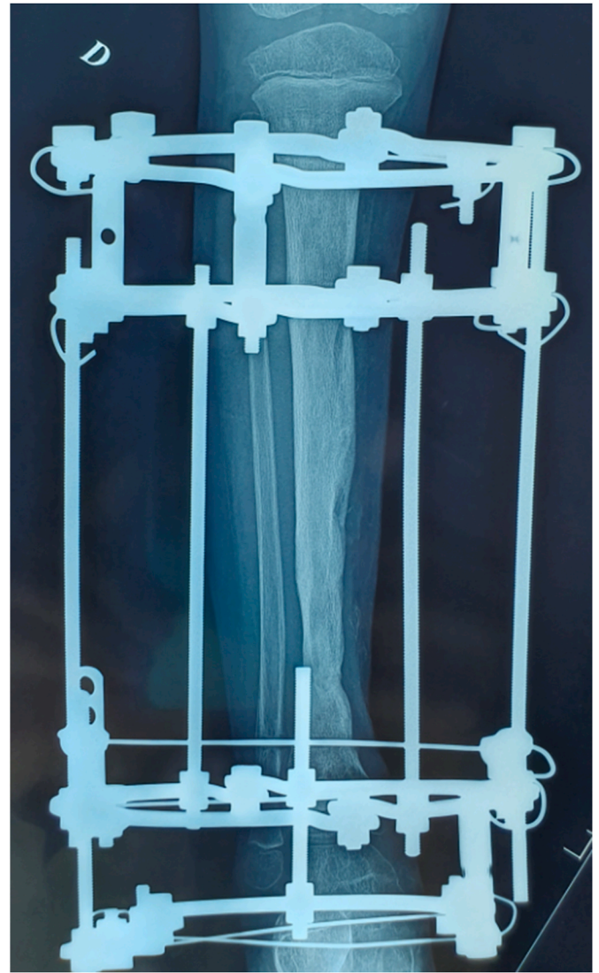
Fig. 4. X-ray at 6 months of Ilizarov external fixator.

In the presence of a significant spontaneous bone defect, we recommend the induced-membrane technique of bone reconstruction described by A.C. Masquelet to shorten the healing period and prevent septic nonunion [15]. Masquelet technique is an efficient procedure for long bone reconstruction after severe infection [16]. However, to obtain optimal results, it is essential to follow the principles of the two stages of the procedure. After debridement, the technique involves separately placing a foreign body membrane using a cement methyl methacrylate polymer spacer followed by a second procedure to fill the defect with cancellous bone. The induced membrane is like a biological chamber that protects the autograft and induces new bone formation promoting growth factors secretion [17]. This technique is used in the tibia for one