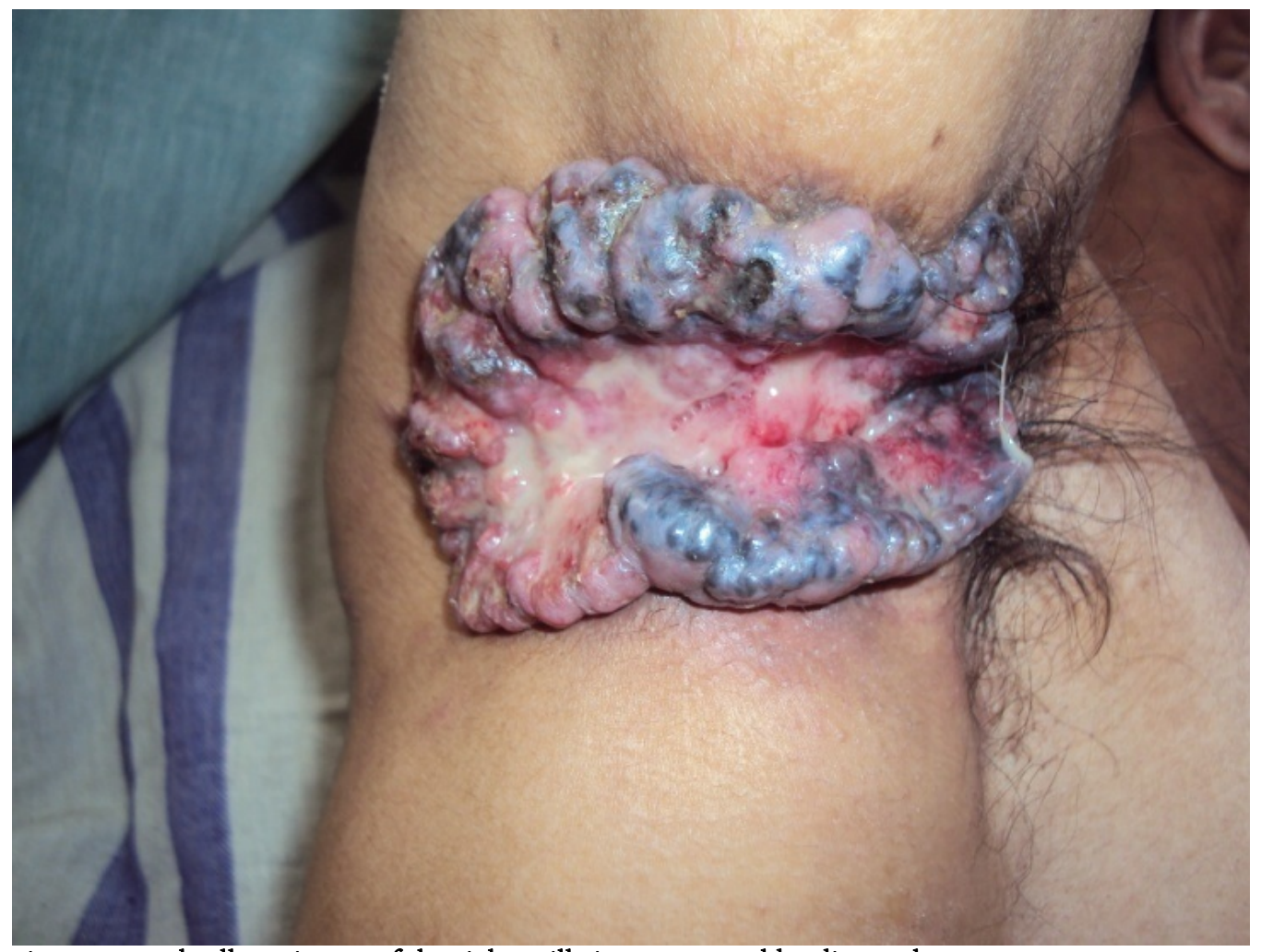
Figure 1. Basal cell carcinoma of the right axilla in a 35-year-old Indian male.