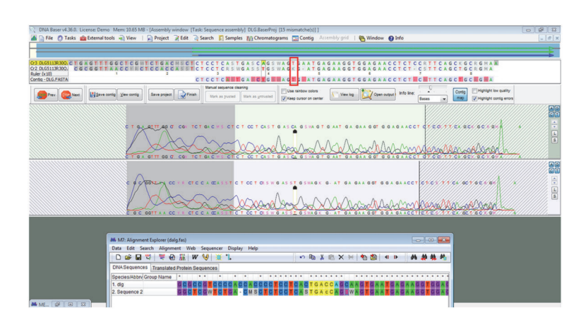
FIGURE 2: SNP at position rs1248696, T>C substitution in a patient with Crohn's disease.

In the fragment of CARD15/NOD2 analysed in the present study, no SNP position was found in patients with CD or UC. However, Strober et al. emphasize that polymorphisms in the CARD15/NOD2 gene are significantly associated with dysregulation of the mucosal immune response to commensal microorganisms. CARD15/NOD2 is a member of the NODlike receptor family (NLR) and is a receptor for bacterial peptidoglycan. Thus CARD15/NOD2 polymorphism is associated with an inappropriate immune response to intestinal bacteria, which in turn leads to quantitative or qualitative changes in the bacterial population in the intestinal lumen or lamina propria, causing inflammation. CARD15/NOD2 mutations have been shown to lead to decreased intestinal production of \alpha -defensing by Paneth cells and to a loss of immune response to pathogens. CARD15/NOD2 dysfunction has also been shown to lead to the development of CD by inducing changes in the intestinal microflora, thereby affecting immune effectors. There are also reports that CARD15/NOD2 dysfunction may cause immunoregulatory dysfunction of the innate immune response, which may also lead to the development of inflammatory bowel disease [13].