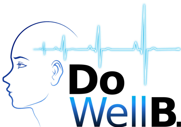
Figure 2 Design Of WELL Being monitoring systems (Do Well B.): from signal perception to emotional reaction.

Provenance and peer review Not commissioned; peer reviewed for ethical and funding approval prior to submission.