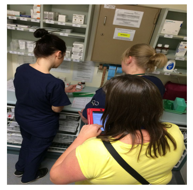
Figure 1 Observer using a handheld device with Precise Observation System for the Safe Use of Medicines (POSSUM) software to record details of medications being prepared and administered to patients.

medication charts. Observers recorded the number of interruptions to nurses (defined as an external stimulus which required the nurse to switch tasks),<sup>16 18</sup> if the nurse multitasked (defined as conducting two tasks in parallel, eg, responding to a question while also drawing up a drug), or if a parent was present at the patient's bedside at the time of medication administration. Observers were instructed not to intervene unless they witnessed an administration error which was potentially dangerous (online supplementary appendix 1). One observer was chosen as the gold standard data collector. Inter-rater reliability was assessed on multiple occasions until all the other observers reached substantial to perfect consistency with the gold standard observer (kappa scores >0.83 for medication strength, >0.93 for medication form, 1 for route and >0.76 for double-checking).