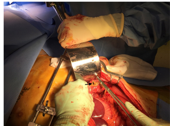
Fig. 3 Intraoperative view of the reduced splenic flexure. Black arrow points to the colonic perforation